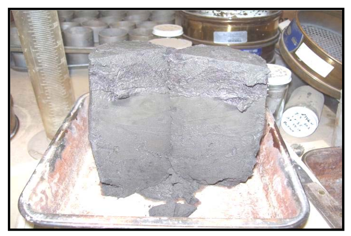
Figure 2: "Undisturbed" Fly Ash Sample: Evidence of Compression During Sampling