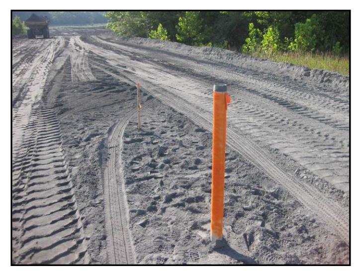
Figure 5B: Completed Settlement Plate--Long term Monitoring

The surveyors had difficulty measuring the initial elevations of the settlement plates, as they moved during installation due to the instability of the upper flyash from the vibrations of the construction equipment. These plates settled 3 to 12 inches (75 to 300 mm) during the first three months. Most of the settlement in the near-surface fly ash occurred in the first 24 hours after placing the surcharge. The excess porewater pressures dissipated rapidly as measured by the transducers. The CPT dissipation tests predicted rapid dissipation and generally measuring 50% decay within 2 minutes, which occurred too quickly to measure using DMT dissipation tests. The settlement plates have measured less than 1 inch (25 mm) of additional movement after the first 3 months.