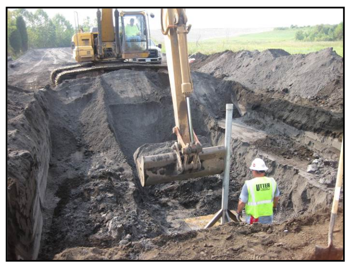
Figure 5A: Settlement Plate Installation