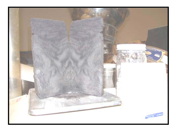
Figure 1: "Undisturbed" Fly Ash Sample: Evidence of Vertical Mixing

Geotechnical engineers and drillers have difficulty obtaining a representative sample of fly ash material that is saturated, non-cohesive and has relatively low strength. Even if a sample is obtained it is often difficult to get the sample to the surface and transported to the laboratory for testing. Figures 1 and 2 show examples of typical disturbance that can occur during the field sampling of saturated fly ash samples.